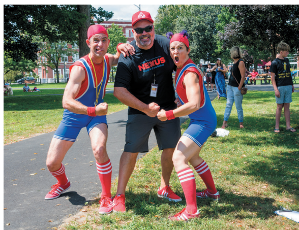
Clowning around with Acrobuffos at Nexus '21

After months of intense planning, it's time for Lebanon Opera House's highly anticipated party of the summer! As with last year's inaugural festival, Nexus has been designed as a FREE family-friendly, immersive three-day experience with activities scheduled sequentially in Colburn Park, on the Main Stage located behind LOH, on the pedestrian mall, and in the rail trail tunnel.