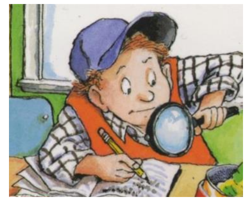
Illustration by R.W. Alley